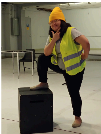
Photo of what our show volunteers will be wearing