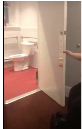
3. The accessible washroom. It's equipped with an automatic door opener and grab bars.