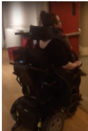
2. Moving through the hallway on the second floor