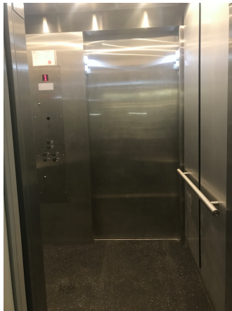
1. The elevator to get to the second floor

Below are pictures that map out the pathway to get to the accessible washroom. There will be signs on the day, along with volunteers to help you find the way!