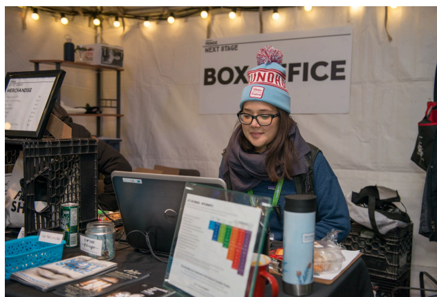
Photo of the Next Stage Box office, inside the tent